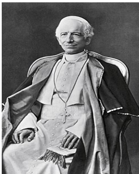
Pope Leo XIII in Inimica Vis (1892)

“An error which is not resisted is approved; a truth which is not defended is suppressed. He who does not oppose an evident crime is open to the suspicion of secret complicity. For surely our whole life is involved in a constant battle in which our salvation itself is at stake; nothing is more disgraceful for a Christian than cowardice.”