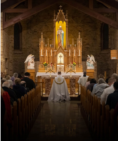
The Shrine Chapel

In October of 1871, a drought caused a fire in a nearby town of Peshitigo. It raged through the entire area. In fear of their lives the families Adele had been educating rushed to the shrine grounds. They processed around the shrine grounds praying the Rosary asking the Blessed Mother for help. As they prayed through the night the rains returned and put out the fire.