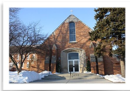
Shrine of Our Lady of Champion

The National Shrine of Our Lady of Champion and the surrounding area is simply spiritually amazing; there is a peace there that just cannot be described. For those who have not had the opportunity to visit this shrine we would encourage you to prayerfully consider visiting the site, as our Blessed Mother said, "Go and fear nothing, I will help you." LEARN THE STORY OF THE FIRST AND ONLY APPROVED MARIAN APPARITION SITE IN THE U.S. (See next Article)