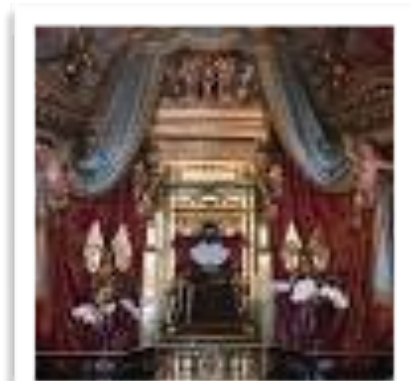
St. Catherine of Bologna