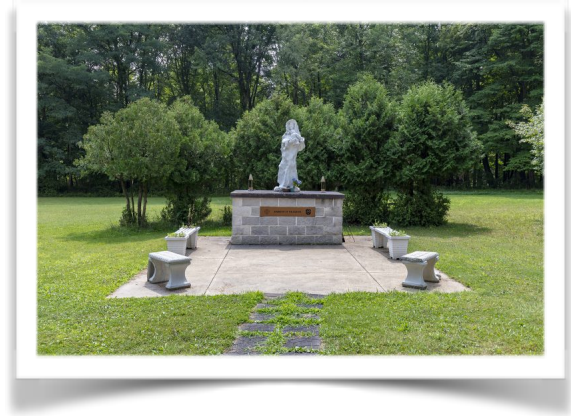
Our Blessed Mother Statue