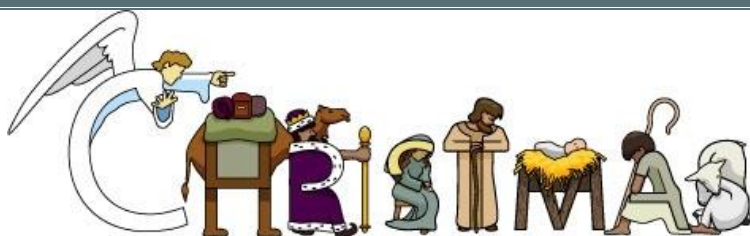
CHRISTMAS IS THE CELEBRATION OF THE BIRTH OF JESUS, THE SAVIOUR OF MANKIND