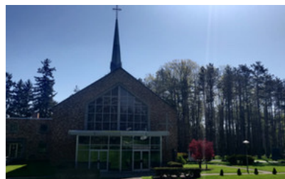
Shrine of Our Lady Comfort of the Afflicted 517 S. Belle Vista Avenue Youngstown, OH 44509