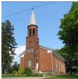
St. Philip Neri Parish Dungannon 11328 Gavers Road Hanoverton, OH 44423

Take a step back in history and explore the beginnings of St. Philip Neri Parish in Dungannon, Ohio, the oldest continuous Roman Catholic congregation in northern Ohio and those of our beloved Shrine of Our Lady Comforter of the Afflicted in Youngstown.