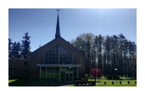
St. Philip Neri Parish Dungannon 11328 Gavers Road Hanoverton, OH 44423